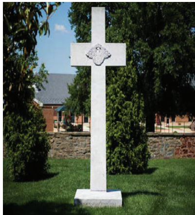
Canadian Cross of Sacrifice